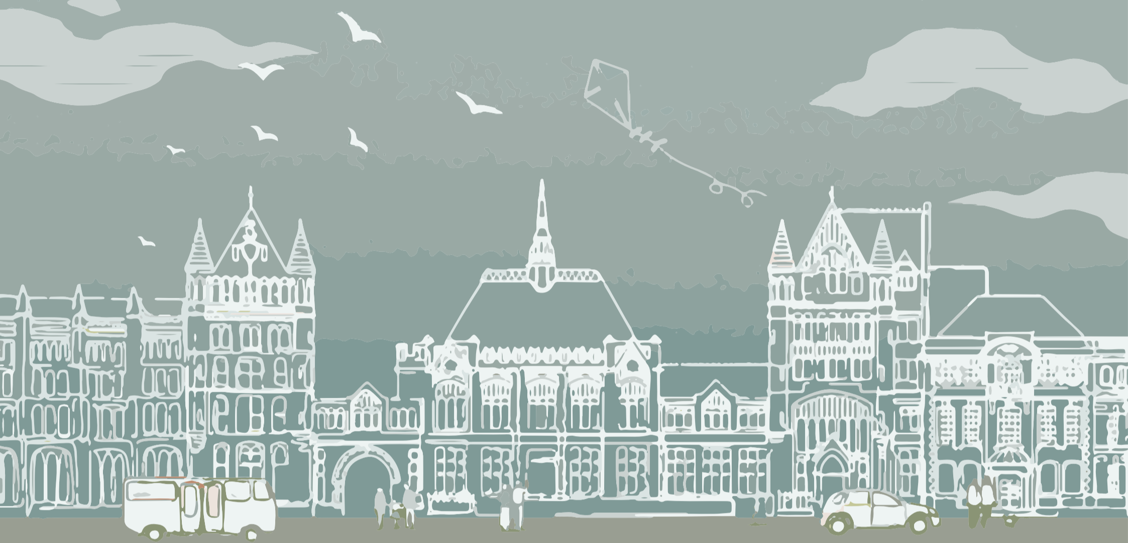
Illustration & graphics